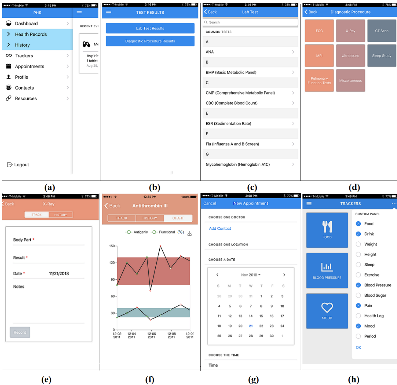
Figure 2. Screenshots of the new mobile personal health record app. (a) Dashboard. (b) Two types of tests in the Test Results section under the Health Records module. (c) A list of commonly ordered laboratory tests. (d) A list of buttons for commonly ordered diagnostic procedures. (e) A simple form for entering a typical x-ray exam result. (f) Graphical test results collected over time. (g) The page for adding a doctor's appointment. (h) The customizable tracker choices.